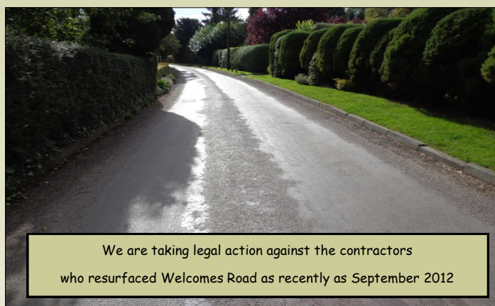
We are taking legal action against the contractors who resurfaced Welcomes Road as recently as September 2012

Our assets are currently about £46,000. We issued 42 reminders about unpaid road levies last month and 32 are still outstanding at the time of writing. There are 212 houses in the roads which we are responsible for, so if you are one of the 15% who have not paid, please do so.